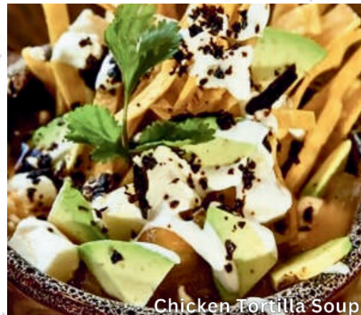
Chicken Tortilla Soup