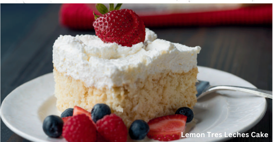
Lemon Tres Leches Cake