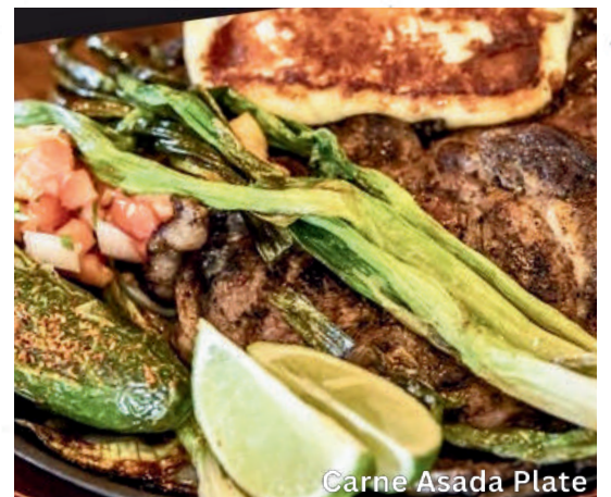
Carne Asada Plate