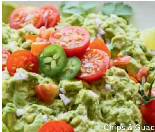
Chips & Guac